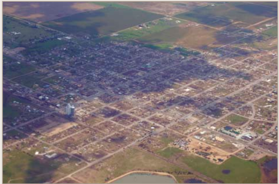
This aerial shows the extent of the damage caused by the F-5 tornado that ripped through the town the night of May 4. Ten people were killed.

Much-needed additional donations to the Greensburg Rebuilding Fund can be sent to Greensburg Rebuilding Fund c/o Greensburg State Bank, P.O. Box 787, Greensburg, KS, 67054.