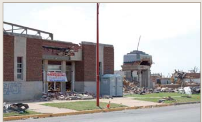
The Greensburg High School was severely damaged. Seniors held their graduation on the municipal golf course two weeks after the tornado struck.