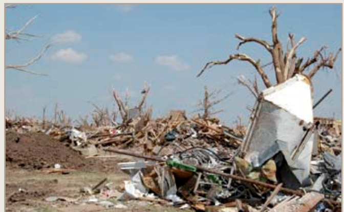
The tornado carved a mile-wide swath of destruction through the town. Two weeks after the storm hit, the town still had about 250,000 cubic yards of debris to haul off.