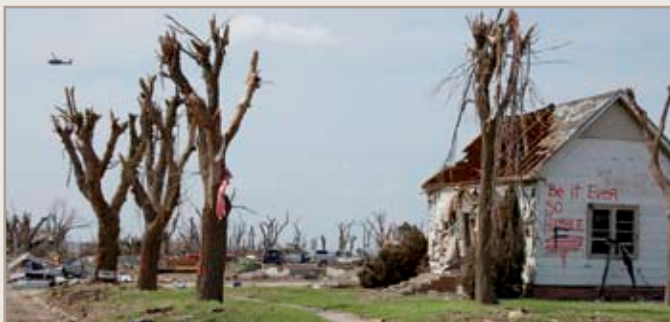
The twister may have wreaked havoc, but it couldn't destroy the spirit of the town's residents.