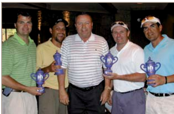
Clarkson Classic 2007 Afternoon Flight Winners